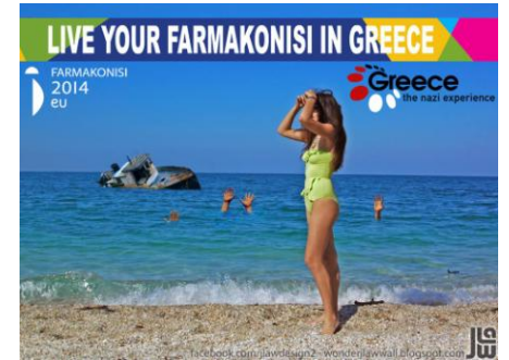
Turkey - Greece sea borders becoming a floating graveyard for undocumented immigrants looking for hope in Europe